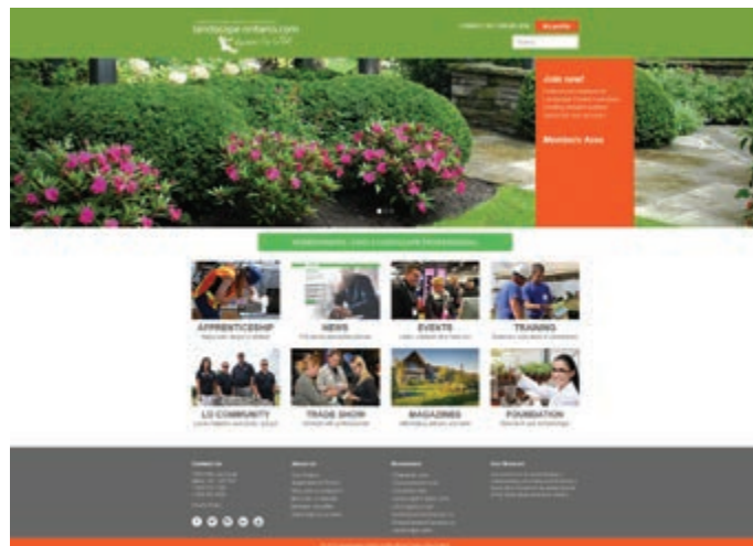
A refreshed HortTrades.com website was launched in July, 2017.

The Nursery/Greenhouse/Floriculture Biosecurity Standard and its com-