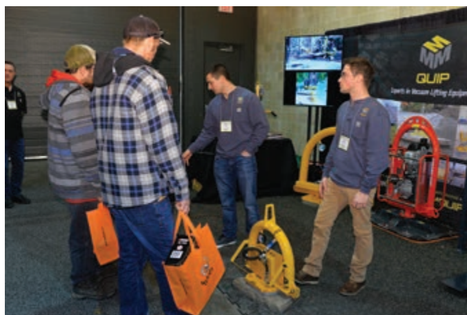
Congress 2017 was often described as "the best Congress ever!"

Congress, Canada's Premier Green Industry Trade Show and Conference, ran Jan. 10-12, 2017. Canada's top green industry event generated a lot of energy among both exhibitors and industry professionals, who helped to celebrate 44 years of beautifying Ontario. Among the main highlights was the upswing in exhibit sales. Revenue trended nearly $30,000 above the event's budget of $1.9 million. Attendance increased by four per cent over 2016, at close to 14,000 delegates. Partners, the Canadian Fence