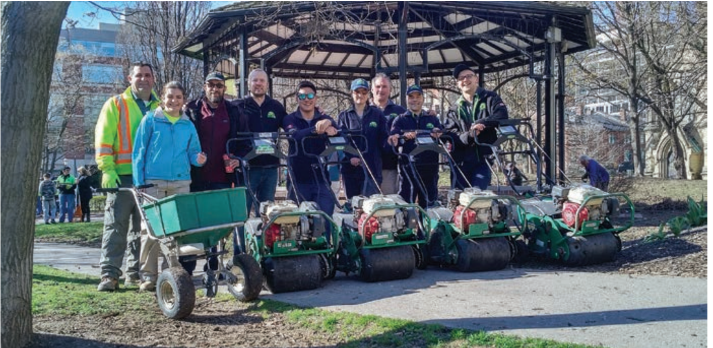
LO members continue to volunteer each spring to clean-up St. James Park in Toronto.