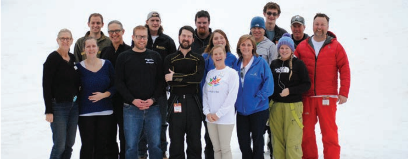
The Georgian Lakelands Chapter's annual Ski and Spa Day continues to be a popular, mid-winter event.

stone edging to re-establish a medicine wheel, and planting new plants. Thank you to all of the volunteers who assisted with this project.