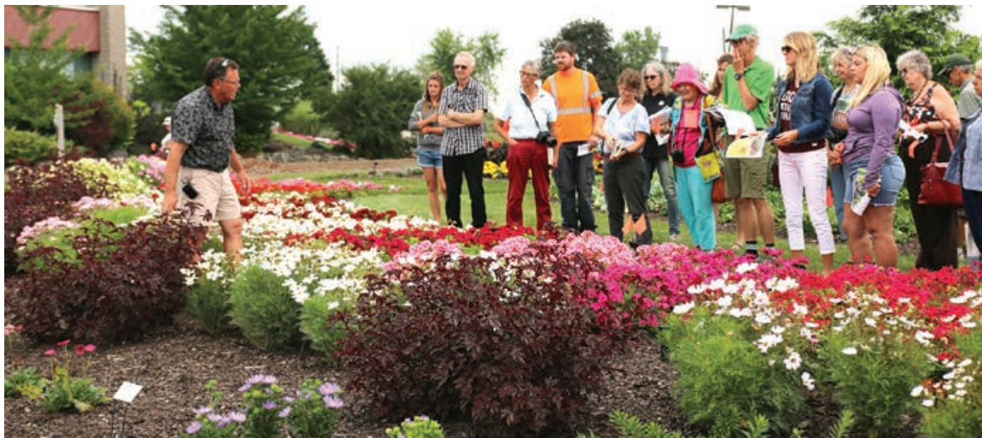
LO's Trial Garden Open House in August attracted over 60 landscape professionals and media.