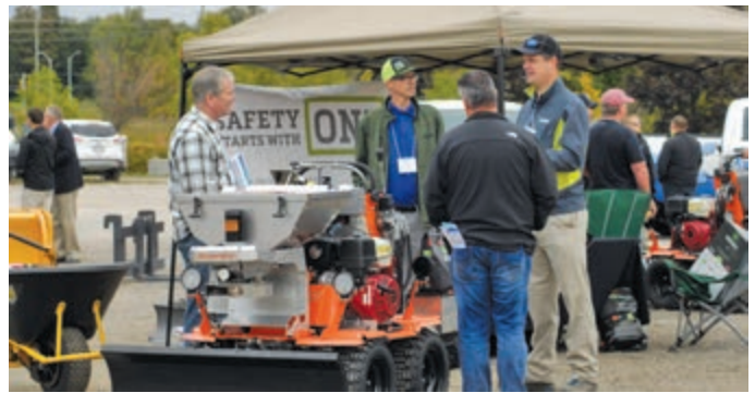
Snowposium returned to LO's home office this September.