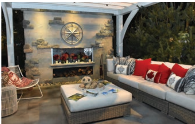
Feature gardens at Canada Blooms celebrated Canadiana to coincide with the nation's 150th birthday.