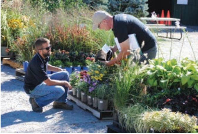
Live judging of plant material at the annual Industry Auction.