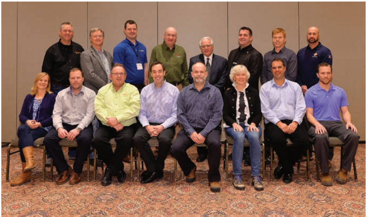
LO's Provincial Board of Directors at the Annual General Meeting in January, 2017.