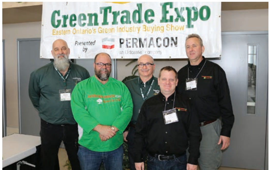
Members of LO's Golden Horseshoe Chapter toured Ottawa Chapter's GreenTrade Expo in February.

Volunteers are the core of support for all Ottawa Chapter events, and even more so in 2017. To quote Helen Keller, “Alone we can do so little;