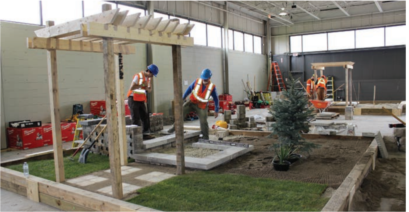
This year's Skills Ontario Competition was held at the Toronto Congress Centre.

The conference program that runs concurrently with the trade show was formatted to optimize scheduling and to deliver maximum value to attendees. Each day began with a keynote speaker, followed by multiple sessions to improve the business skills of members of our profession.